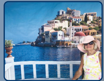
A lovely "vacation" to the Greek Isles.