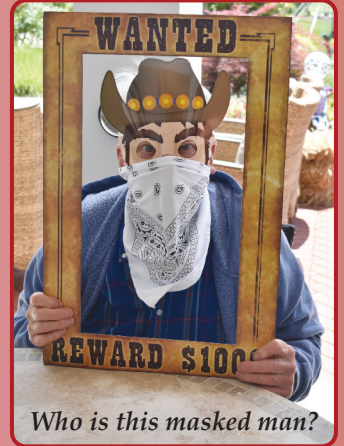
Who is this masked man?