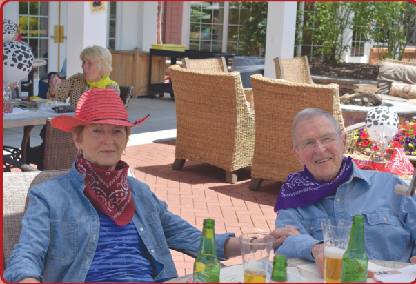
Kicking off the summer with a fun and tasty Country Hoe Down!

Summer is a great time to get outdoors. Activities organized some terrific events that had everyone out and about the community. From golf to swimming to "cruising the Mediterranean" or enjoying a good old-fashioned country hoe down, there sure was something for everyone.