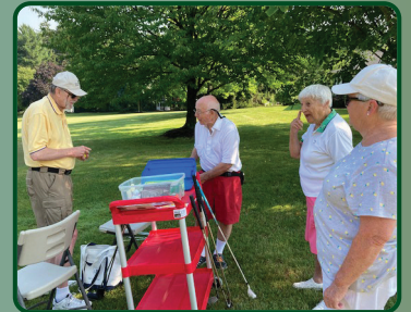
New this summer, the Chip & Putt (Par-Tee) club has become popular.