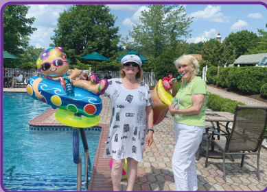
Party at the Pool!